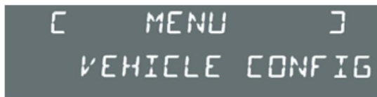
Display Type A